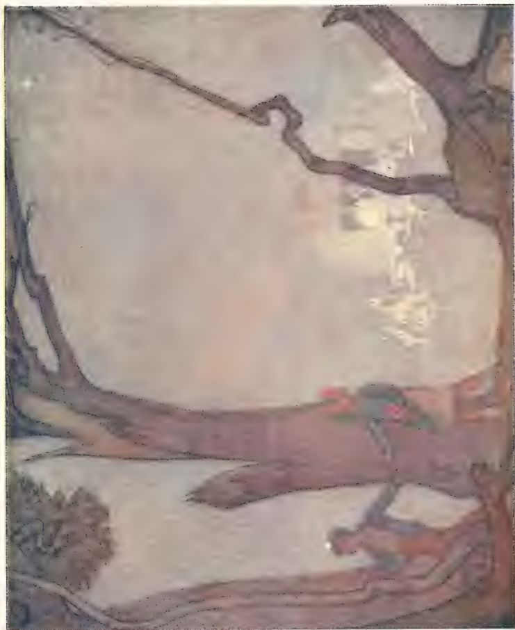
THE LITTLE BIRD AND THE TREE